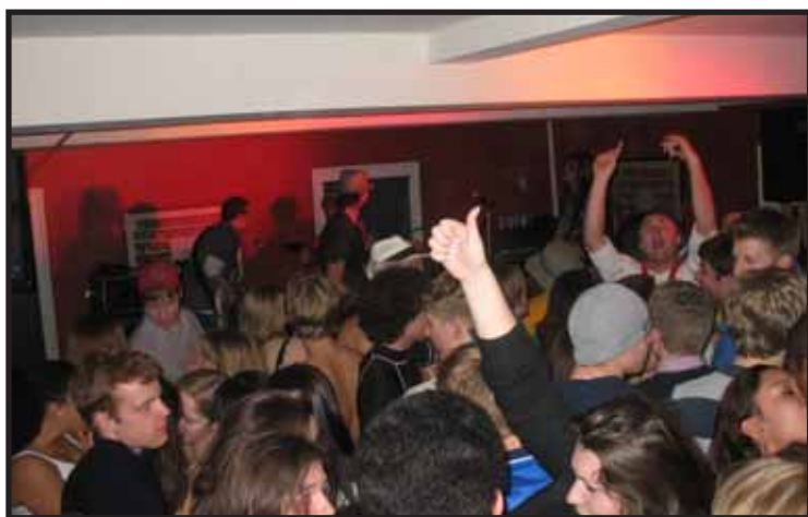
The band Welbilt kept the front room packed during the 33rd Beach Party.

If you can, please come by and see the house, and perhaps even play a game of pong outside in the beautiful fall weather. But whether you visit or not, we are proud to say that AXA is, and always will be, the Magic Green Cottage.