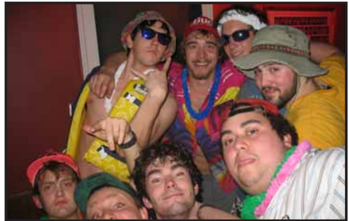
Members of the '07 class pose for a pic during the extremely well attended 33rd Annual Beach Party.

remained a strong and vibrant place and the future is looking even brighter. As '07 trea-