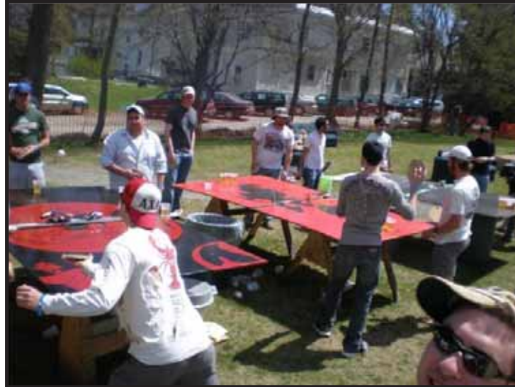
The pre-Pigstick pong scene featuring the 08 (left) and 07 Class Tables.

Last summer we started refinishing the wooden benches in the basement, but did not get very far because of the