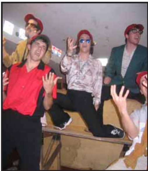
Members of the class of 2009 serenade Sigma Delta members during the Fall 2006 Cheeseball.

As those of you who have visited the renovated house have noticed, the changes to the interior layout erased the tube room from existence. As a temporary solution,